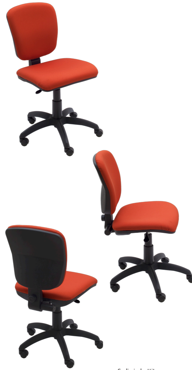
Sedia imbottita Upholstered chair