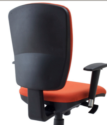
Dettaglio schienale Backrest detail