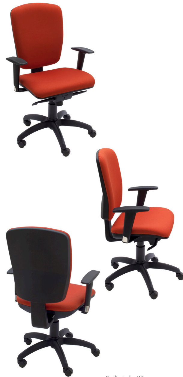
Sedia imbottita Upholstered chair