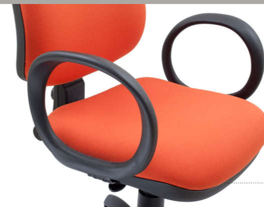
Dettaglio bracciolo Armrest detail