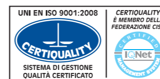
grafico: trattocostile design