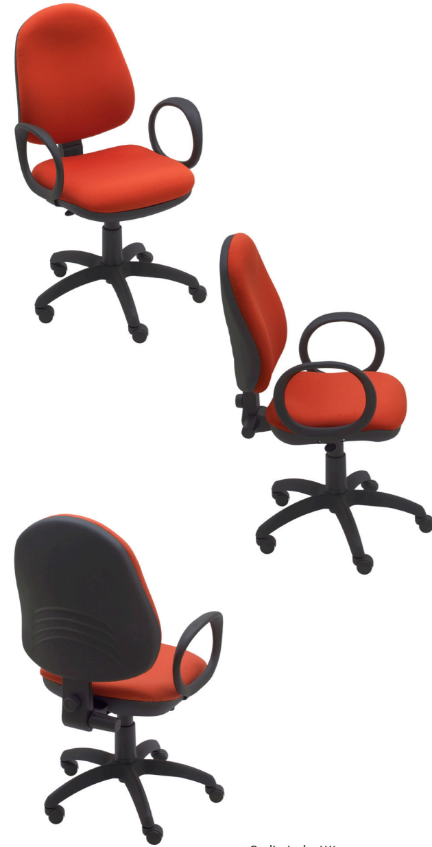
Sedia imbottita Upholstered chair