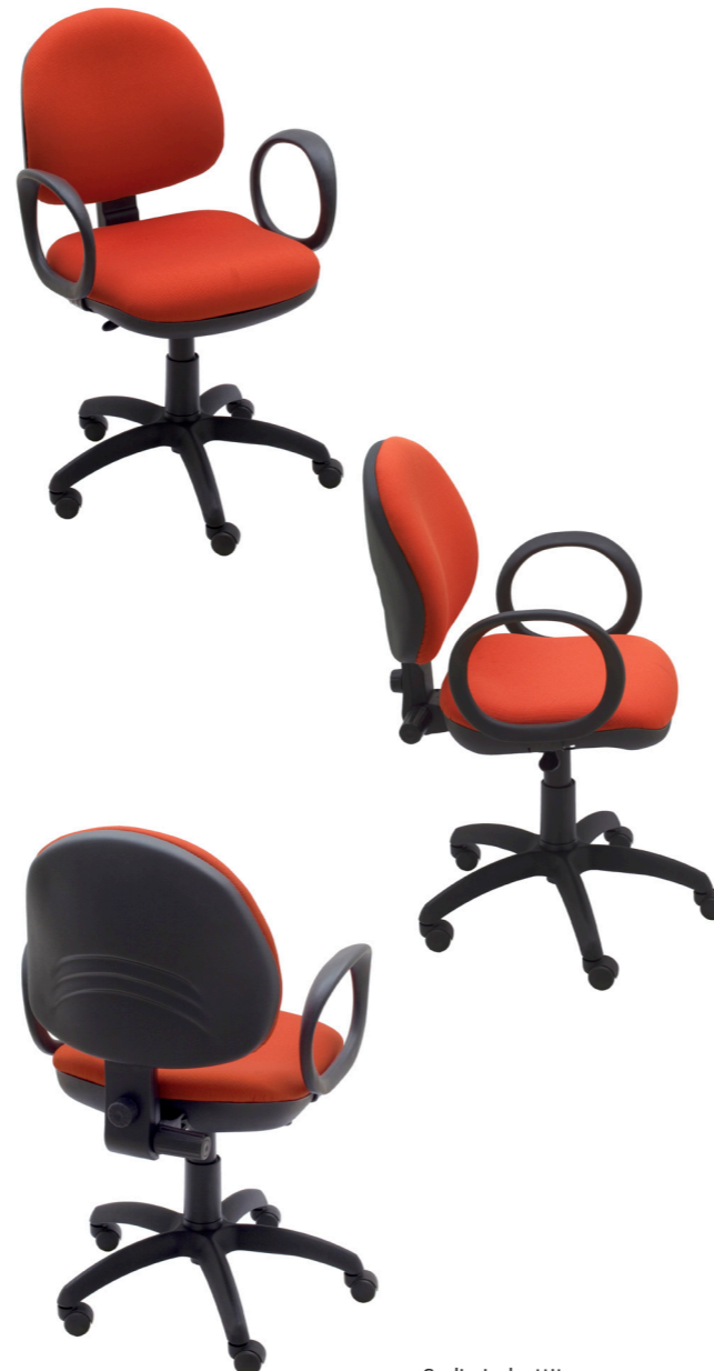
Sedia imbottita Upholstered chair