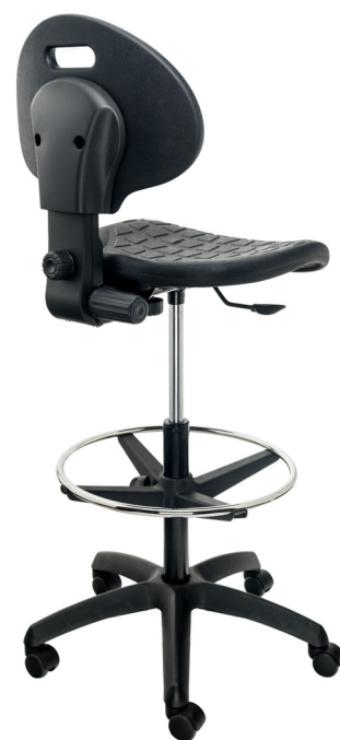
Sedia imbottita Upholstered chair