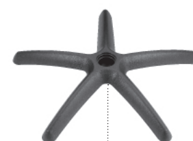
Base Nylon 600 600 Nylon base