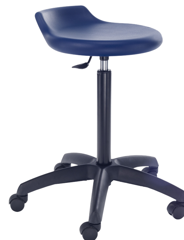
Sedia imbottita Upholstered chair