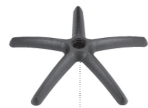
Base Nylon 600 600 Nylon base